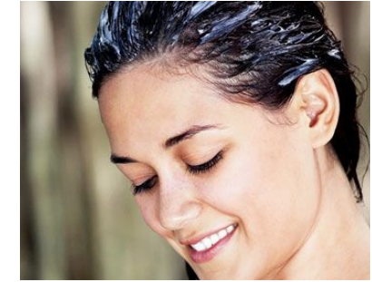
17 tips for healthy hair and skin