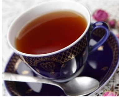
Health benefits of black tea